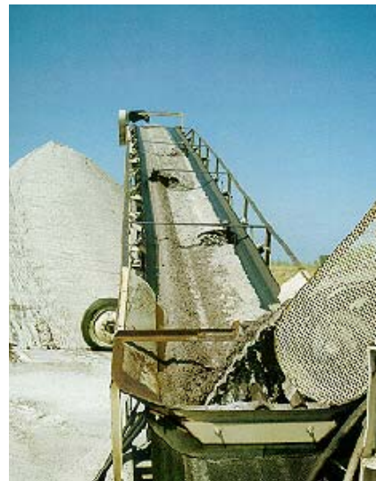
Figure 7 - The final product.