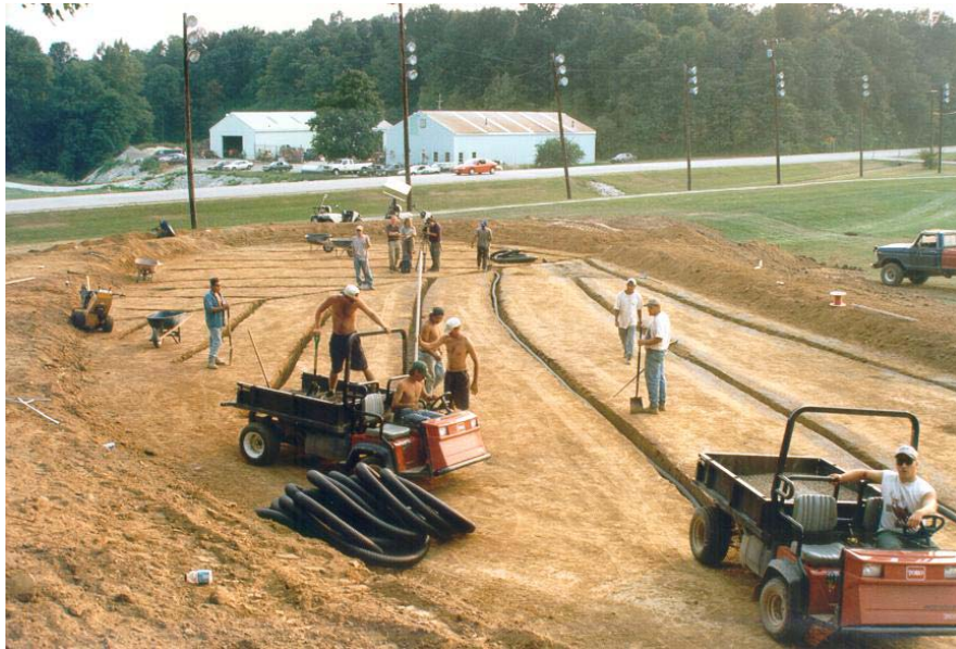
Figure 2 – Lateral lines should be spaced not more than 15 feet (5 m) apart and have a natural fall to the mainline of at least 0.5%.

Drainage pipe shall be perforated plastic, minimally conforming to ASTM 2729 or ASTM F 405, with a minimum diameter of 4 inches (100 mm). Waffle drains or any tubing encased in