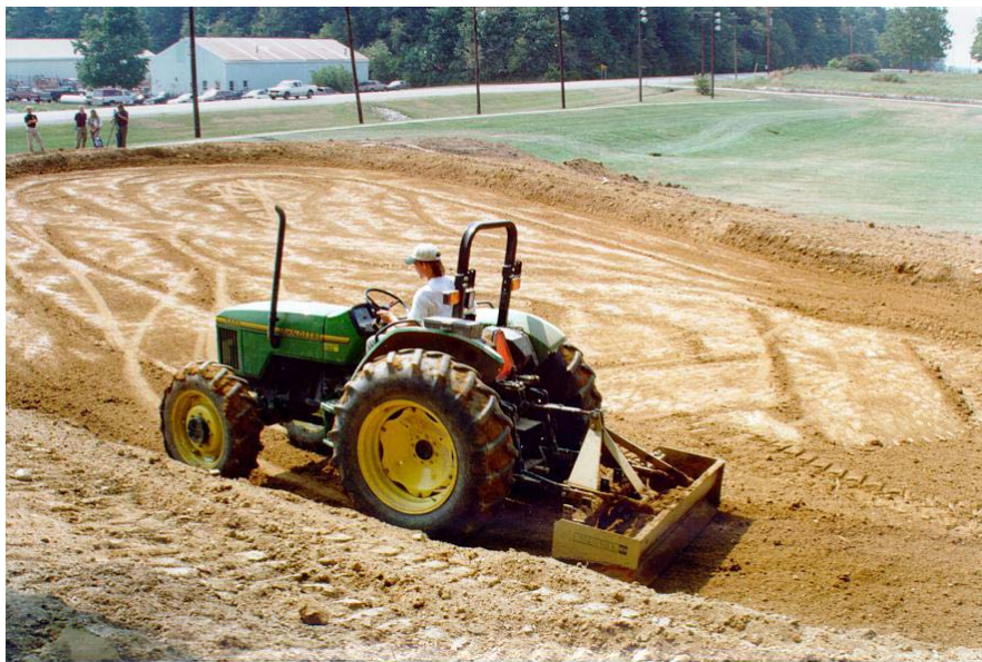
Figure 1 - The subgrade must be smooth, firmly compacted, and be free of water-collecting hollows.

Construct collar areas around the green to the same standards as the putting surface itself.