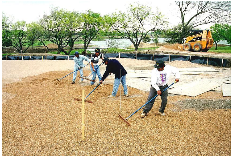
Figure 3 - Gravel drainage blanket installed to proper depth by using grade stakes.

The LA Abrasion test (ASTM C-131) should be performed on any materials suspected of having insufficient mechanical stability to withstand ordinary construction traffic. The value obtained using this procedure should not exceed 40. Soil engineering laboratories can provide this information.