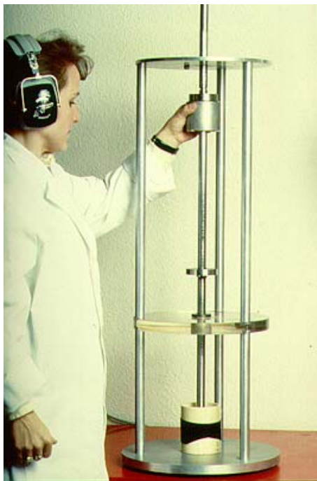
Figure 4 - Laboratory testing of gravel and rootzone materials is mandatory to ensure the success of a green built to USGA guidelines.

Furthermore, any gravel selected shall have 100% passing a 1/2" (12 mm) sieve and not more than 10% passing a No. 10 (2 mm) sieve, including not more than 5% passing a No. 18 (1 mm) sieve.