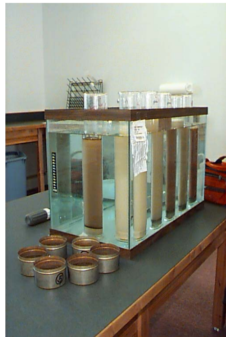
Figure 5 - Testing requires specialized equipment and skills and should be accomplished only by an accredited laboratory