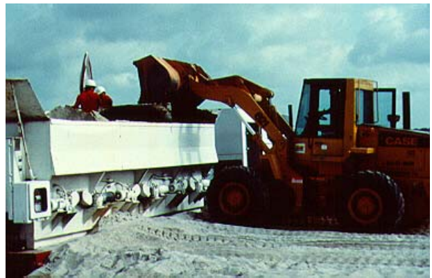
Figure 6 - Rootzone components must be blended uniformly. Mechanical blenders are best suited to this task.

Porous inorganic amendments such as calcined clays (porous ceramics), calcined diatomites, and zeolites may be used in place of or in conjunction with peat in root zone mixes, provided that the particle size and performance criterion of the mix are met. Users of these products should be aware that there are considerable differences between products, and long term experience with some of these materials is lacking. It should also be noted that the USGA requires any such amendment to be incorporated throughout the full 12-inch (300 mm) depth of the root zone mixture. Polyacrylamides and reinforcement materials are not recommended.